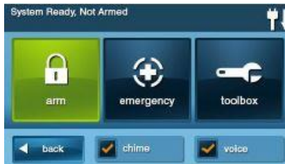
2GIG Main SECURITY Menu