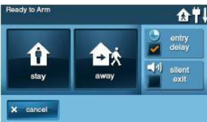
2GIG Arming Screen

Arm System – All protected windows and doors must be closed. Ready light should be green.