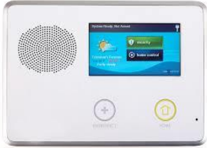
2GIG Go Control Keypad